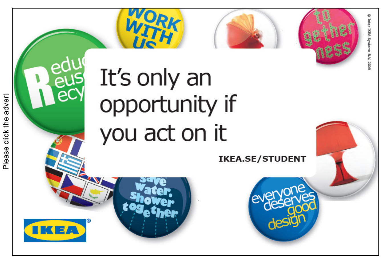
Download free ebooks at bookboon.com

Grouping parts or customers into families has the objective of reducing the changeover time between batches, allowing smaller batch sizes, and thus improving flexibility. Parts family formation is based on the idea of grouping parts or customers together according to factors such as processing similarity.